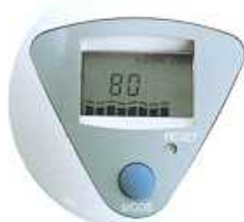
LCD candle capacity meter. (optional)