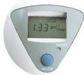
LCD flowmeter. (optional)

But, advances in design are not just confined to the filter housing. A new range of 2 3/4" Candles has been specially developed to improve capacity and maintain Doulton Water Filters exacting levels of filtration capability.